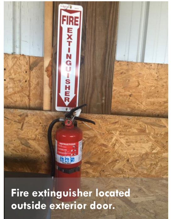
Fire extinguisher located outside exterior door.