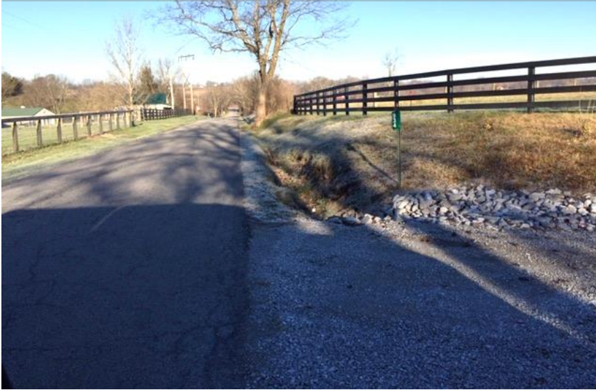
View of Blacks Cross Rd. from property entrance