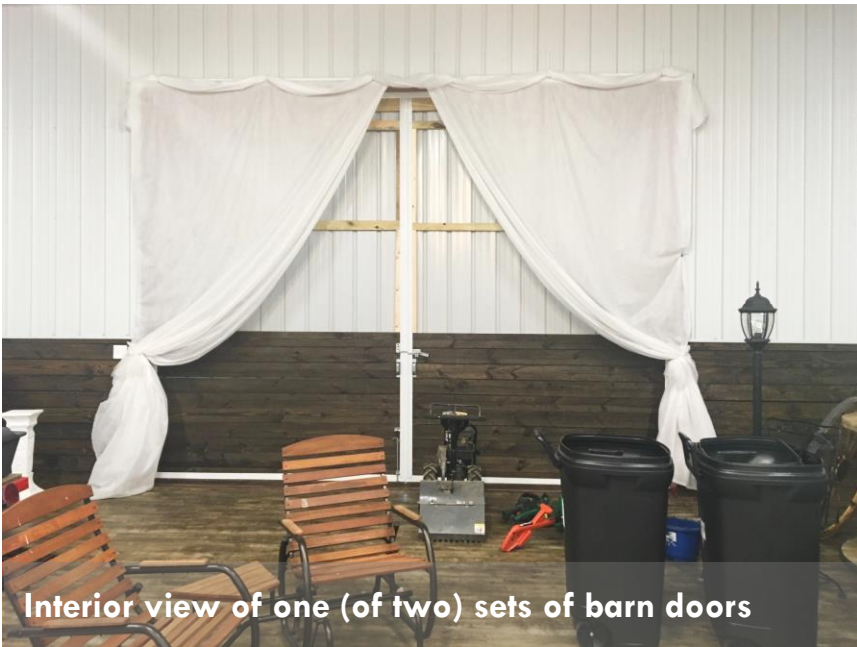
Interior view of one (of two) sets of barn doors