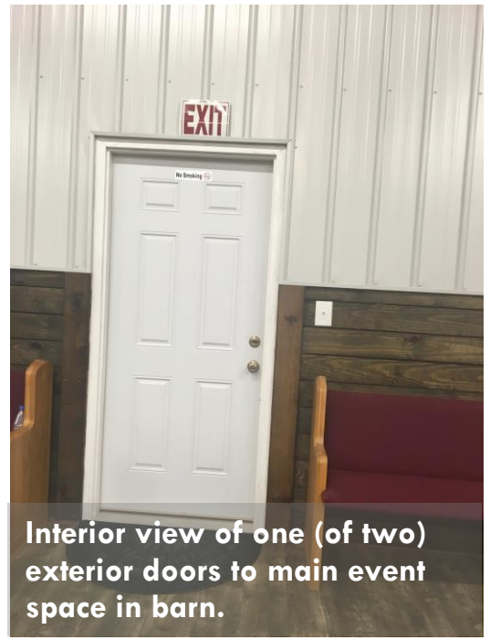
Interior view of one (of two) exterior doors to main event space in barn.