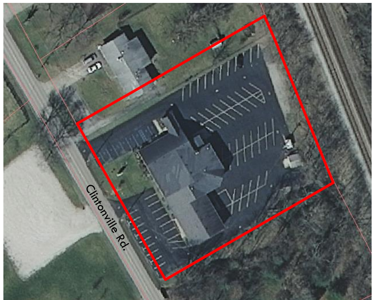
Aerial imagery shown for descriptive purposes only. Measurements are approximate and not shown to scale.