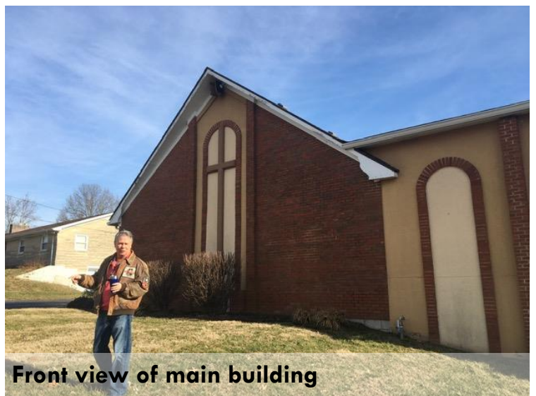
Front view of main building