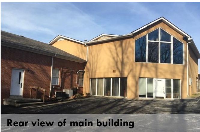
Rear view of main building