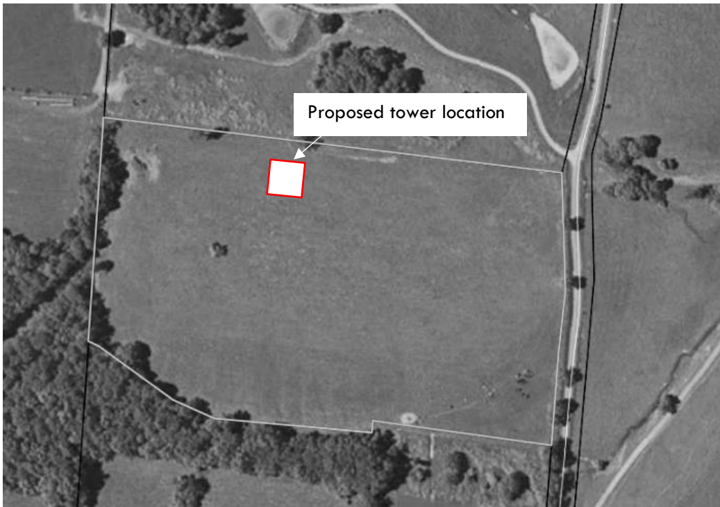
FIGURE 1: Proposed Property

New Cingular Wireless PCS, LLC, a Delaware limited liability company, d/b/a AT&T Mobility requests approval to construct a wireless communications facility on a 15.56 acre A-1 zoned property on Steele Ford Rd. The proposed tower is a 195' monopole with a 4' lightning arrestor (199' total height).