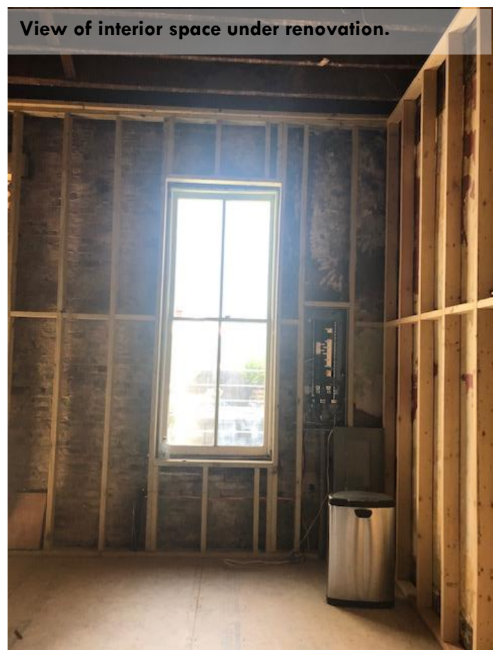
View of interior space under renovation.