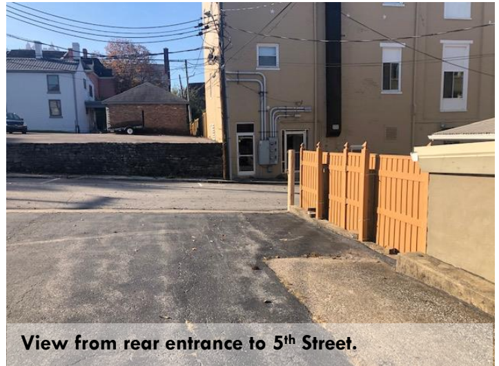
View from rear entrance to 5 th Street.