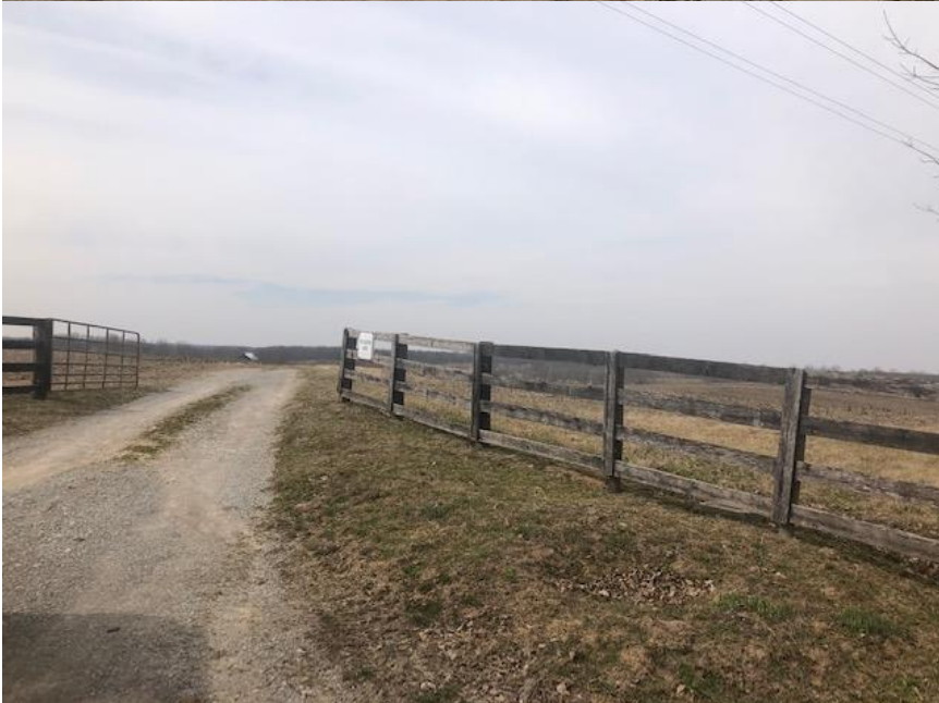
View of property from entrance