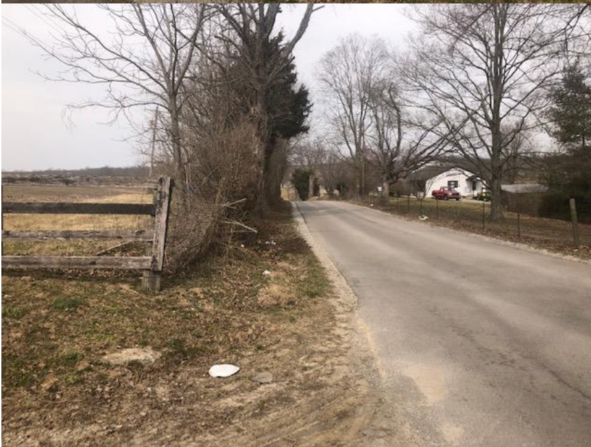
Northbound view of Peacock Rd from property entrance