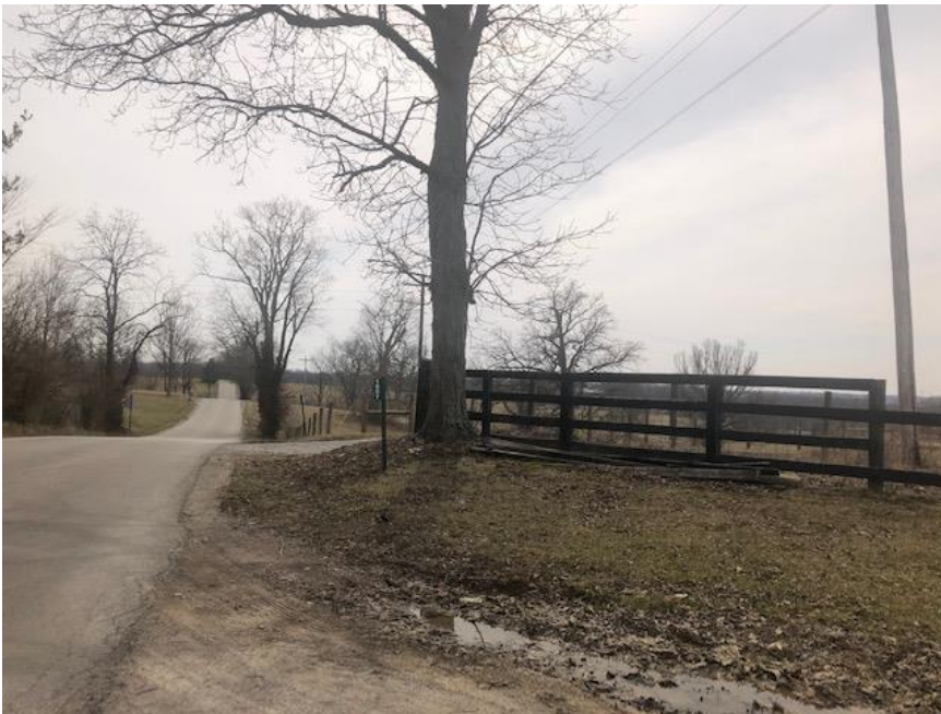
Southbound view of Peacock Rd. from property entrance