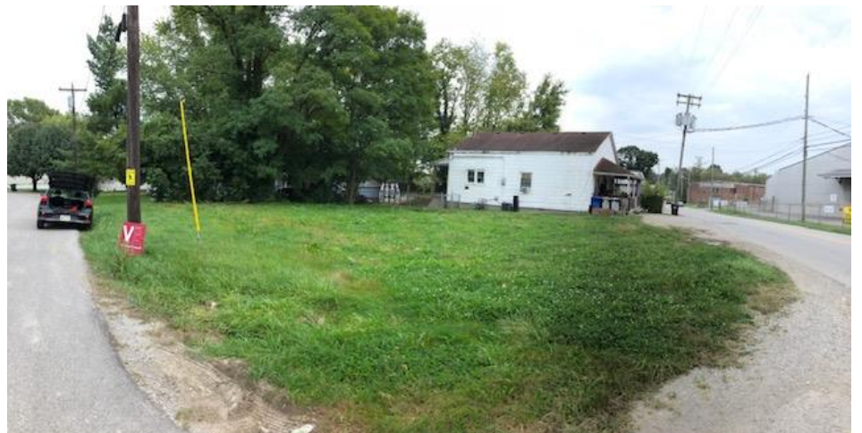
Panoramic view of existing corner lot