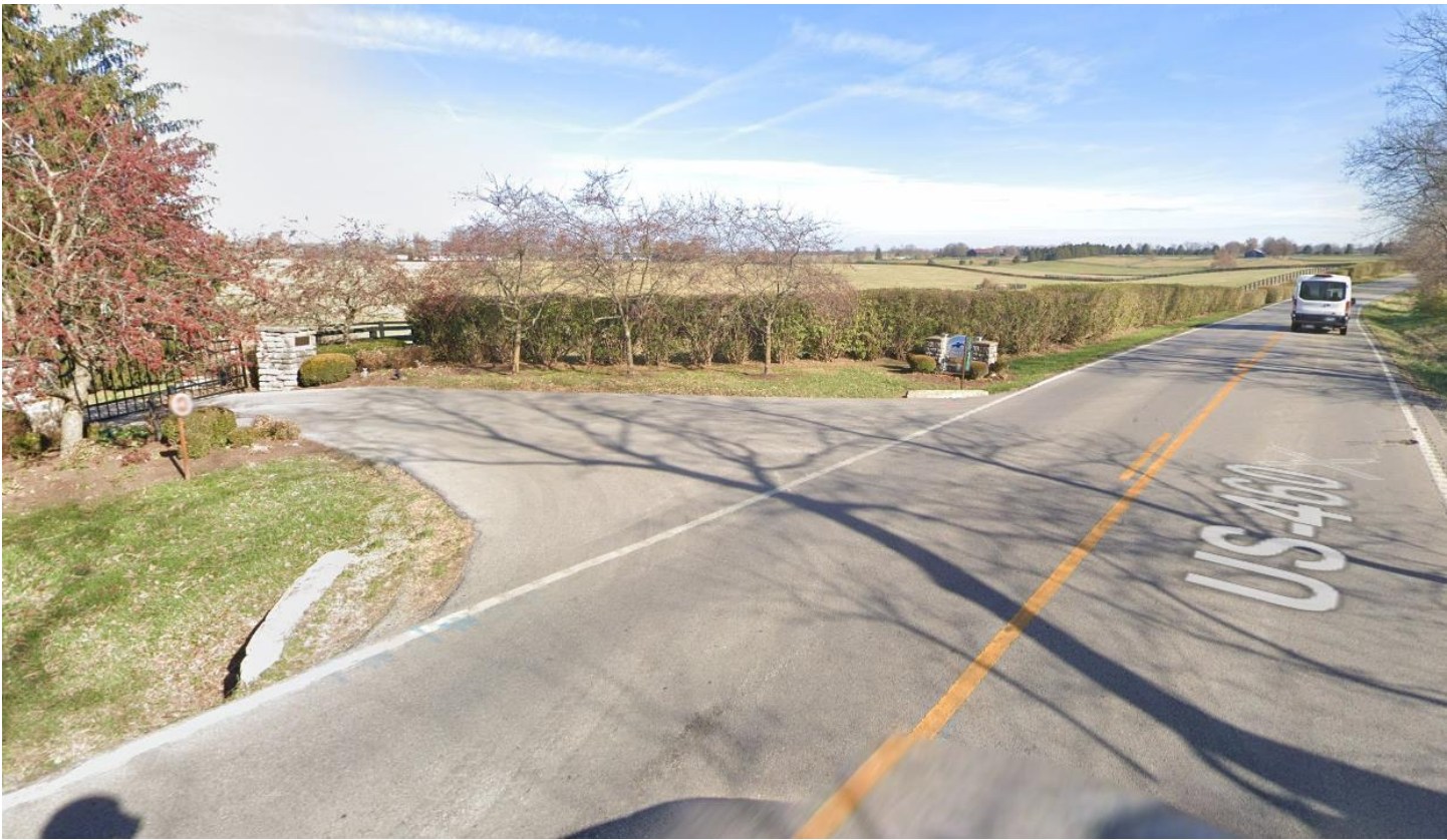
EASTBOUND VIEW OF ENTRANCE FROM GEORGETOWN RD