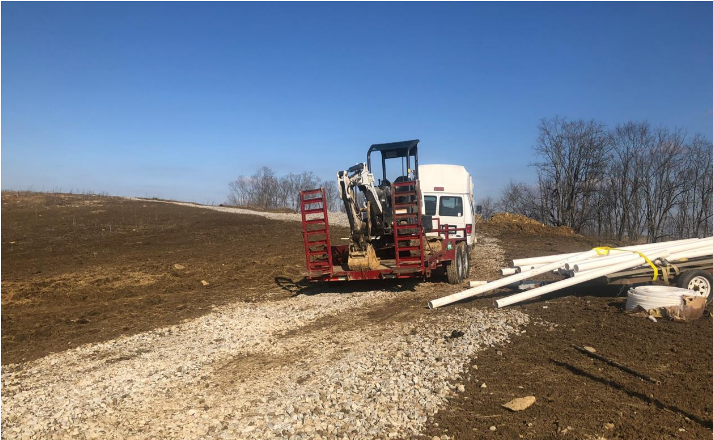
Shown is view from gravel driveway at Lot Young Rd where regrading has been occurring. House construction site located to the right of drive before the tree line.